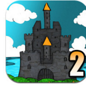
Same Meaning Magic Part II