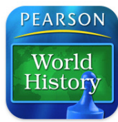
Beyond Textbooks 2010: World History Games