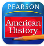
Beyond Textbooks 2010: American History Test Prep