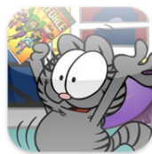
Professor Garfield Online Safety