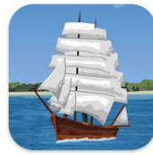
European Exploration: The Age of Discovery