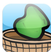
Apples in Hour Hands