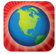
Pass the Past