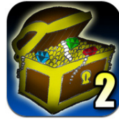
Opposite Ocean Part II