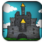
Same Meaning Magic