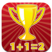
Master the Math