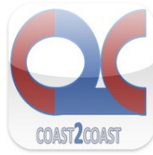
C2C! (Coast to Coast)