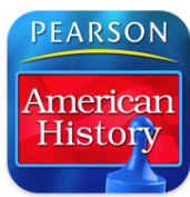
Beyond Textbooks 2010: American History Games