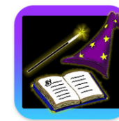
Same Sound Spell Bound